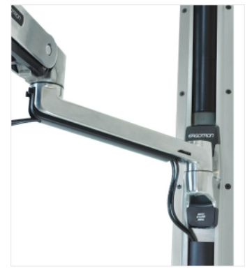
RECOMMENDED: ATTACH WALL MOUNT ARM TO AN ERGOTRON WALL TRACK USING BRACKET (97-091)