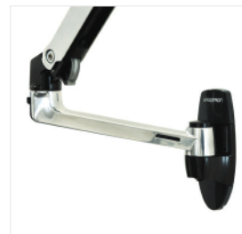
LX EXTENSION INCREASES REACH BY 9" (23 CM) WHITE (45-289-216) POLISHED ALUMINUM (45-289-026) MATTE BLACK (45-289-224)